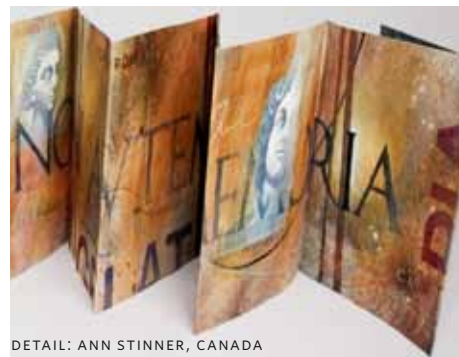
DETAIL: ANN STINNER, CANADA